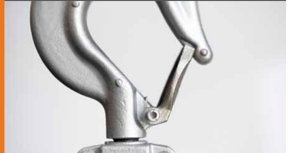
Robust cast iron latches