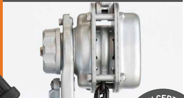
Precision chain alignment guide