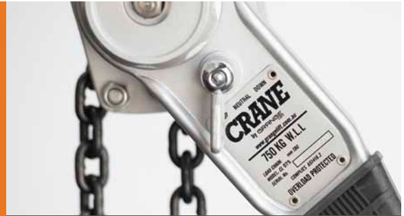
Single action directional trigger, with neutral