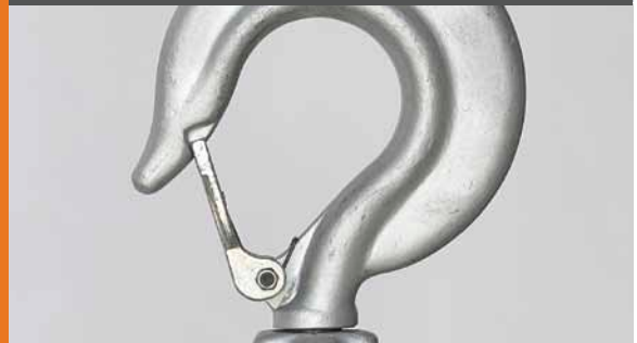
Robust cast iron latches