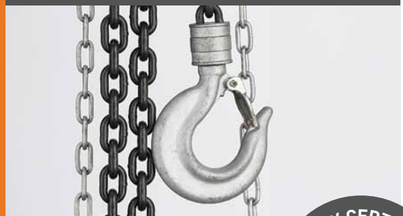
Custom lengths available