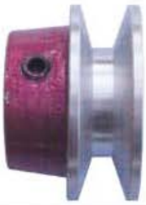
SINGLE GROOVE 1A