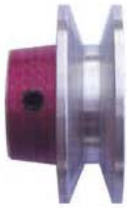
SINGLE GROOVE 1B